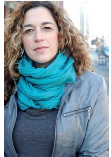
Kristi Jacobson, co-director of A Place at the Table , a Magnolia Pictures release.