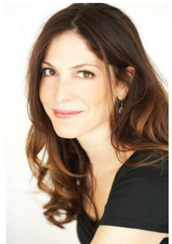
Lori Silverbush, co-director of A Place at the Table , a Magnolia Pictures release.