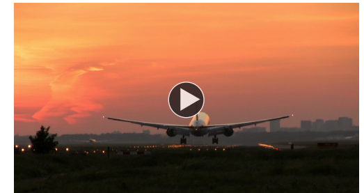
A HARD PILL TO SWALLOW